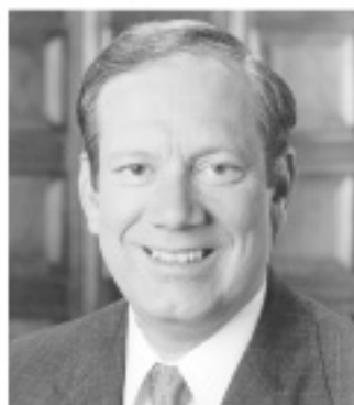
GEORGE E. PATAKI GOVERNOR