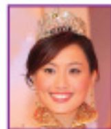
陳法拉小姐 Ms. Fala Chen